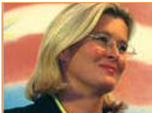
Ursula Plassnik, Minister of Foreign Affairs of Austria

GAERC, General Affairs and External Relations Council is meeting on 10 and 11 April in Luxembourg. On Monday the meeting is bringing together the Ministers of Foreign Affairs and the Ministers of Development. On the second day only the Ministers responsible for foreign affairs are meeting.