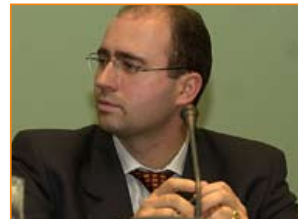
Rossetti di Valdalbero

Domenico Rossetti di Valdalbero, European Commission and Paraskevas Caracostas, European Commission are set to speak on competition within the 25 countries of the European Union.