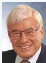
Christian Schwarz-Schilling -EU Special Representative for BiH-

Start: 31/01/2006 Nationality: DE Working Languages: DE, EN